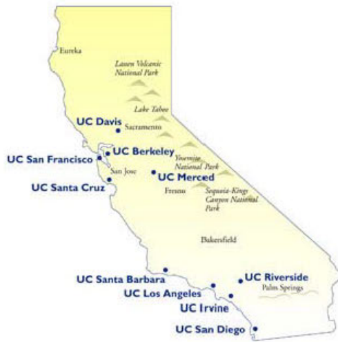
University of California's 10 Campuses