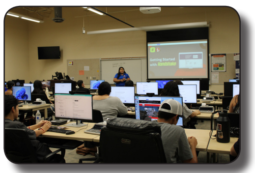
Thank you to the IVC MESA Center for sponsoring pizzas for the attendees.