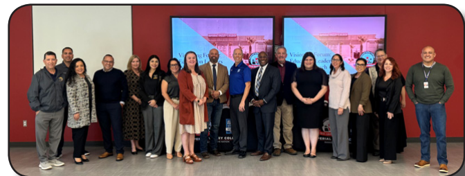
Superintendents, Principals, Athletic Directors, and ICOE leaders